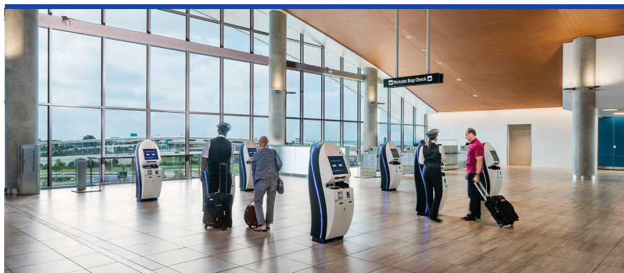
TPA's innovative remote bag check system was recently highlighted on the national stage.