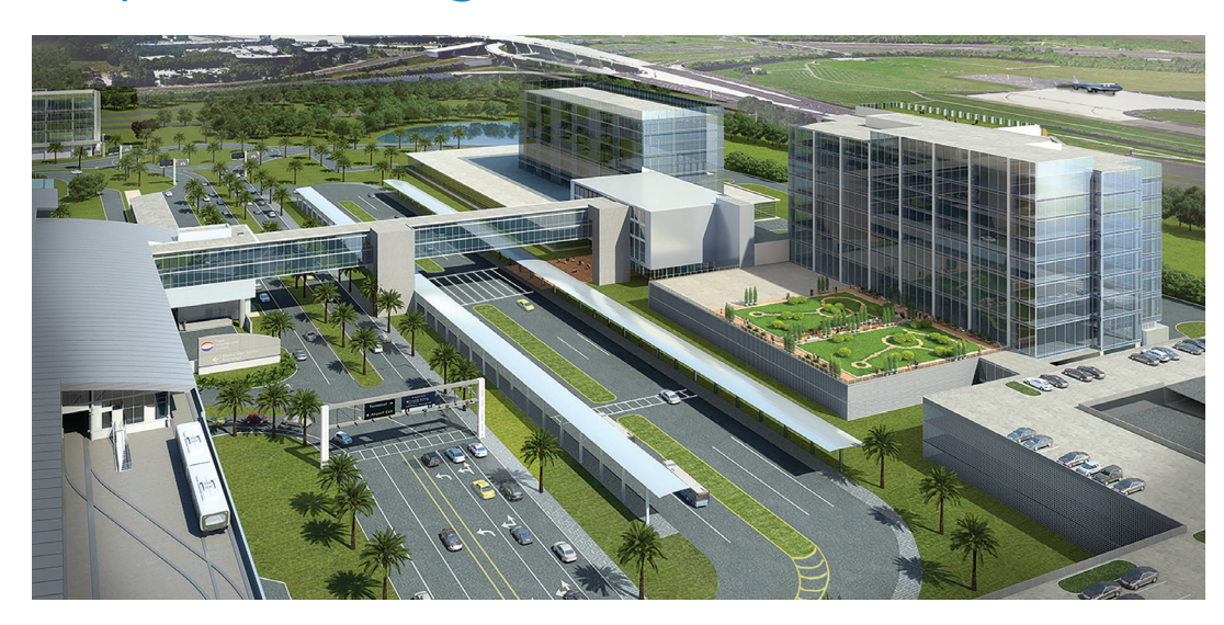
Phase 2 of TPA's Master Plan expansion includes new curbsides, a 17-acre real estate development area (pictured) and new connections to regional trails. The commercial area features hotels, office space, retail and a gas station.

he Hillsborough County Aviation Authority Board of Directors on Thursday approved a $132.4 million budget amendment allowing initial work to begin on Phase 2 of the Master Plan later this year.