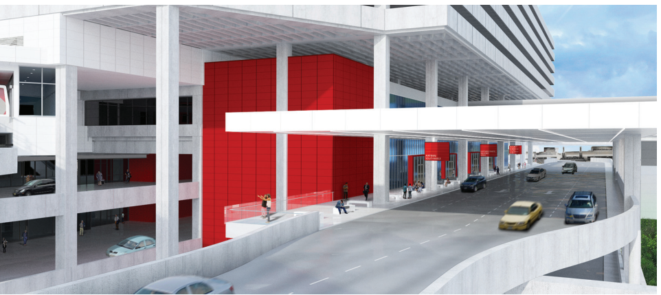
The development area also includes connections to regional trails (middle rendering) and new express curbsides for those without checked baggage.