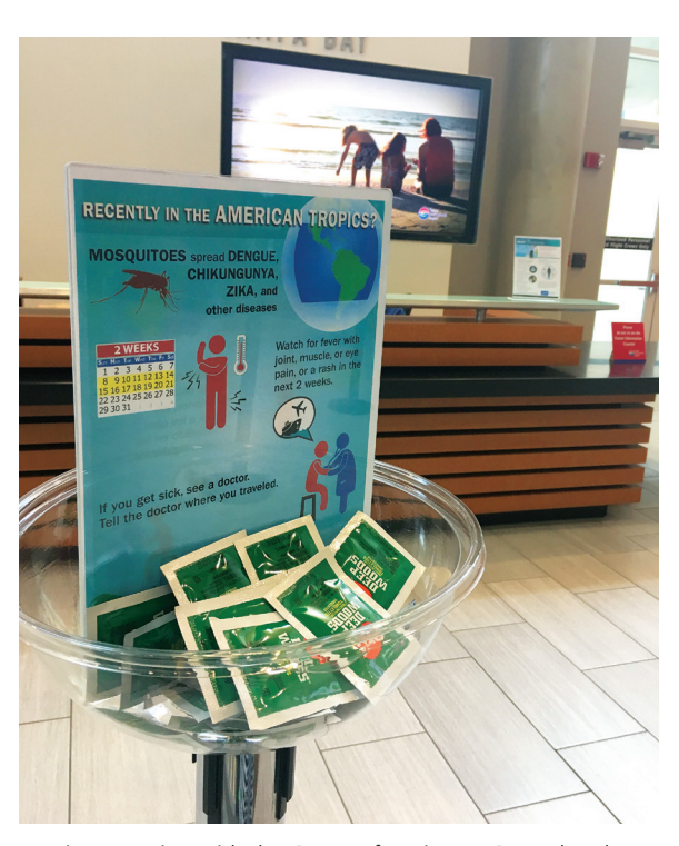
TPA is partnering with the Centers for Disease Control and Prevention to help prevent the transmission of Zika, a virus spread primarily through mosquitos.

Tampa International Airport, in partnership with the Centers for Disease Control and Prevention (CDC), is doing its part to help prevent the transmission of Zika, a virus spread primarily through mosquito bites. Zika outbreaks are happening all over the world, including parts of Florida and areas to which we have direct flights. TPA is launching a Zika awareness campaign to help prevent the spread of Zika among our travelers and our community.