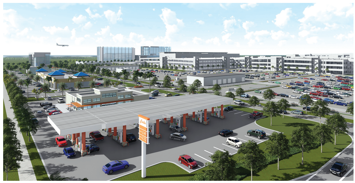
The new 17-acre real estate development area includes a gas station (pictured in front), retail space, two new hotels and an office building. HCAA Board members unanimously approved a $132.4 million budget amendement allowing initial work to begin on Phase 2 of the Master Plan later this year.