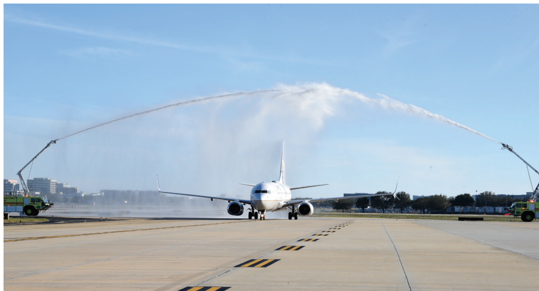
Tampa International Airport welcomes the inaugural flight from San Francisco with a water arch. The United flight arrived around 4:51 p.m. and departed for SFO about an hour later. Both legs of the flight were full.

T ampa International Airport on Feb. 16 celebrated the launch of nonstop daily service between Tampa and San Francisco on United Airlines. The Airport welcomed the arriving plane with a water arch salute, a San Francisco-themed cake and live music highlighting the new destination. United also treated employees and inaugural passengers to hot dogs, hamburgers and brisket on a plane-shaped grill designed to look like a 777.