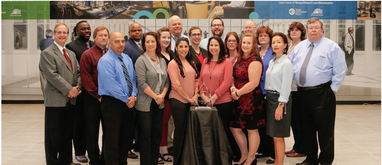
Tampa International Airport's procurement team poses with the Pareto Award. The award is the highest procurement honor in North America.