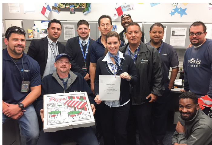
Members of the Copa team take a well-deserved pizza break to celebrate their big win. Copa had an average first bag delivery time of 10 minutes.