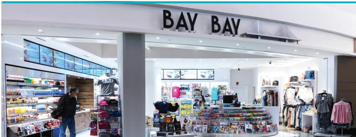
Bay to Bay / Mixx, which is located on Airside F, is the final shop to open up as part of TPA's concessions redevelopment.

On Saturday, Feb. 2, the construction walls for Bay to Bay / Mixx came down at Airside F, completing the Airport's Concessions Redevelopment Program that includes 69 new shops, restaurants and spas. The NewsLink stores combine a shopping and grab-n-go experience in the Airport's international terminal.