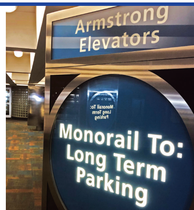
The Long Term Monorail closes Feb. 18.

During this time, employees parking in the Nest will need to access the Main Terminal via the Long Term walkway on Level 4. ■