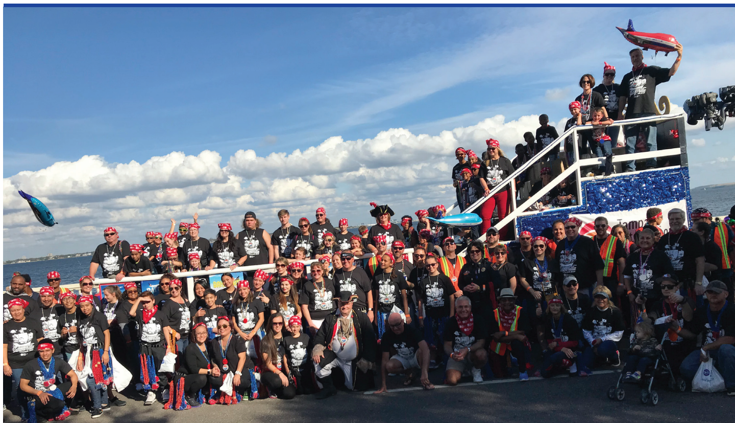
Tampa International Airport employees, friends and family members were out in force for the 2019 Gasparilla Children's Parade on Jan. 19. The parade provided ample bead throwing opportunities as well as a chance to show why TPA is America's Favorite Airport.