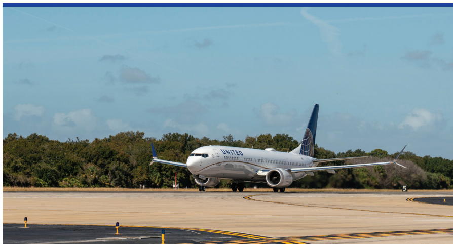
United Airlines is growing its footprint at Tampa International Airport.