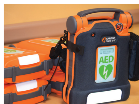
TPA recently purchased 36 Cardiac Science G5 fully-automated AED machines for the Airport, including the Main Terminal and airside.

said Williams. “They are designed to be operated by almost anyone, even someone with no medical background or training. The instructions are clear and the device won't even go onto