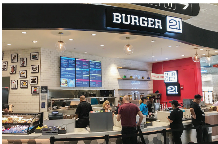
Spanx (top left), The Body Shop (top right) are located on Airside C; Burger 21 (bottom right) is located on Airside A.

Burger 21 is a popular burger joint owned and operated by the locally based Melting Pot company. The restaurant features favorite items from their street-side locations, including beef, chicken, turkey and black bean burgers. ■