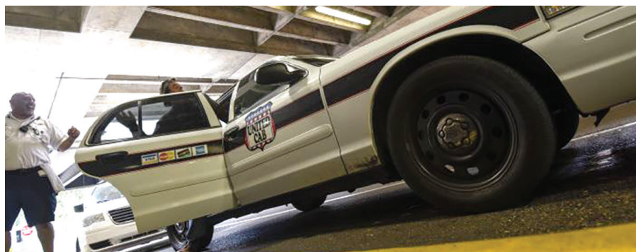
It's now legal to use Uber, Lyft and Wingz at Tampa International Airport.