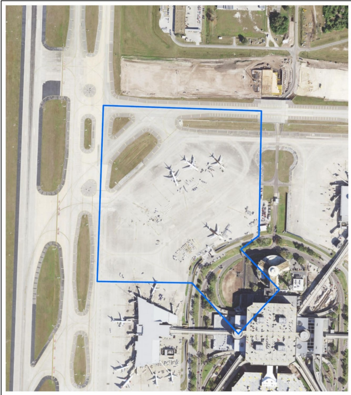
Figure 3: Project Study Area