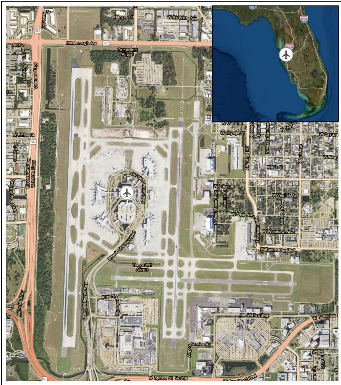
Figure 1: Airport Location