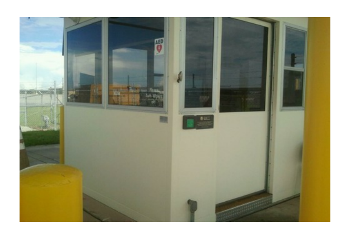
Traffic Division Changes

Traffic CheckPoint SR-3 received a makeover with new paint inside and out, new flooring and a rebuilt desktop.