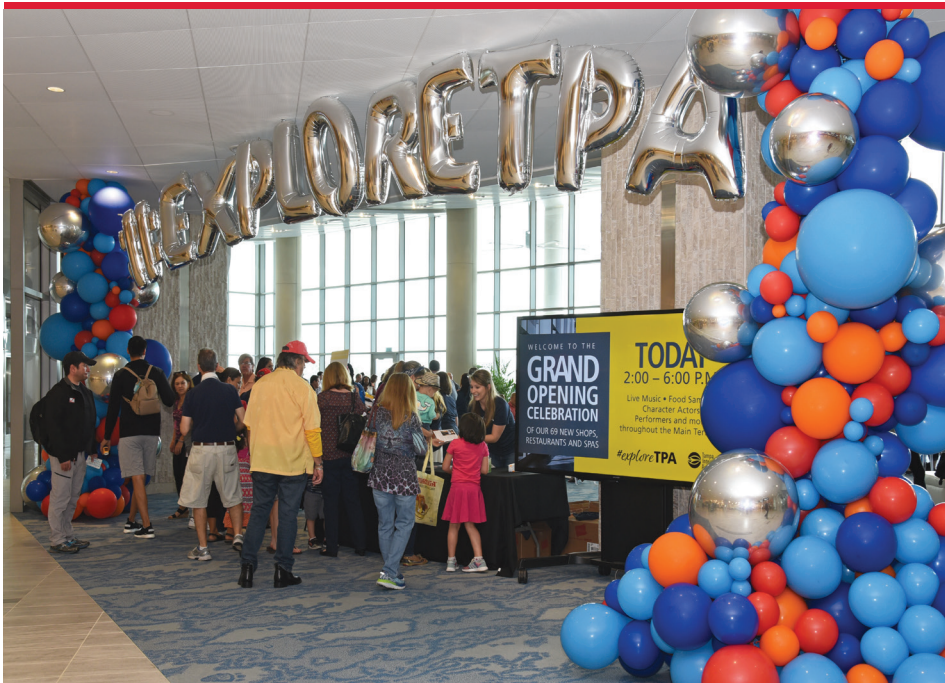
Tampa International Airport's Concessions Grand Opening featured a wide variety of options from TPA's 69 new shops and restaurants, including some from all four post-security airside.