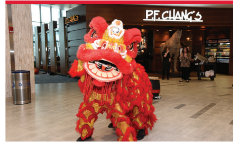
The grand opening featured a wide variety of entertainment options, including a guitar-wielding, stilts-walking rocker (top) and a Chinese dragon dancer.

Beyond the SkyConnect station in the Main Terminal stood a 10-foot man with a wild Mohawk and electric guitar. He was a rocker on stilts and fit well with the ambiance of the Hard Rock Café. To the right, a dragon dancer bounced around in front of P. F. Chang's, representing the Asian culture that the restaurant shares.