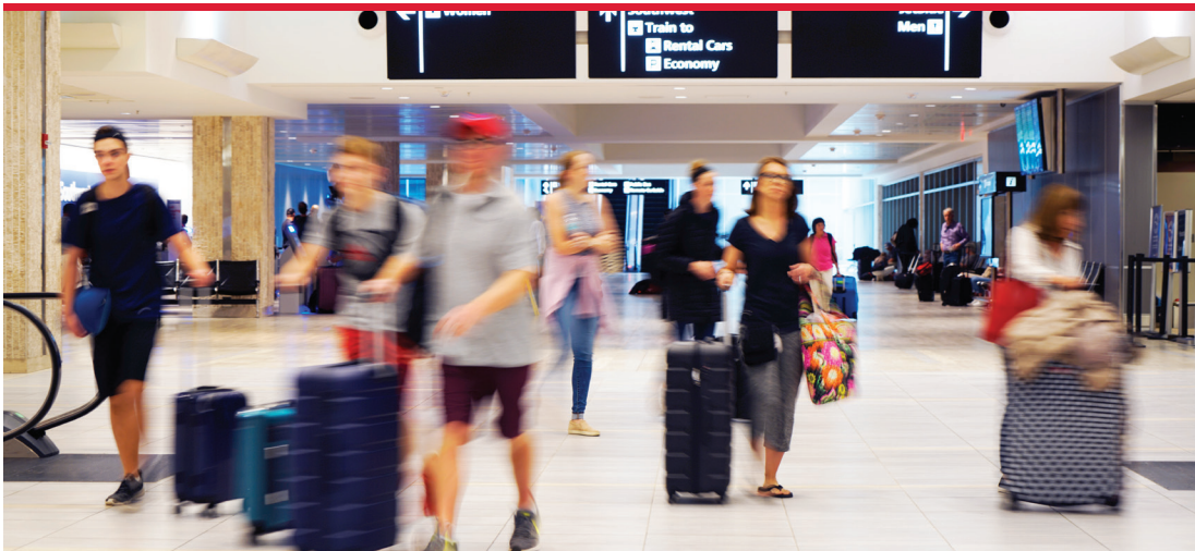
Tampa International Airport expects to see as many as 90,000 passengers in a single day - more people than fit in Raymond James Stadium and Amalie Arena combined. The Airport expects to serve some 3.6 million people in total.