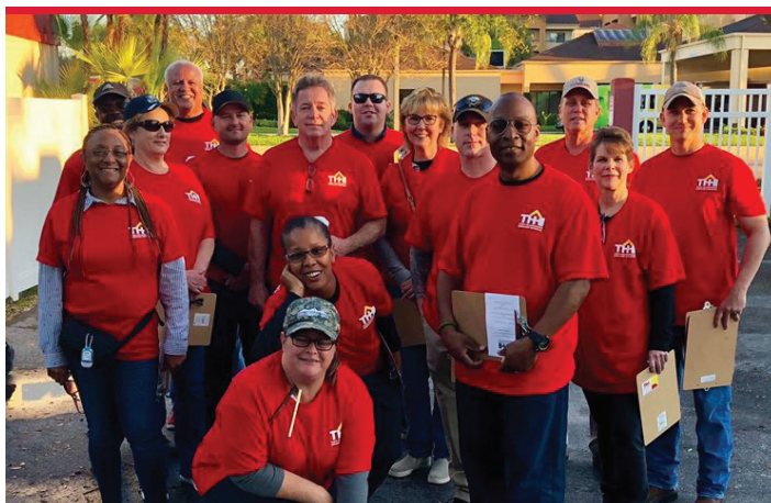
Tampa International Airport Police help with the Tampa-Hillsborough Homeless initiative on Feb. 28.