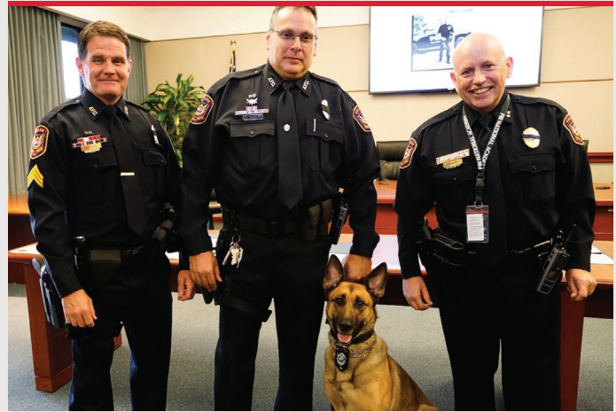
Congratulations to the 43 honorees who were recognized by the Airport Police Department at its quarterly awards ceremony held on Feb. 23. The ceremony included the swearing in of three new officers and a special badge presentation to K9 Anya.