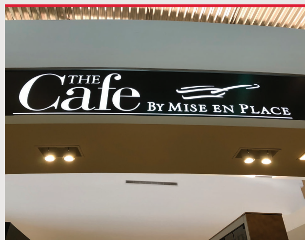
The Café by Mise en Place is now open on Airside F.

The Café by Mise en Place features an expansive menu and bar, a swanky, modern aesthetic and a relaxing atmosphere. Everything on its menu – from their drinks to their entrees – is carefully curated with quality in mind. ■