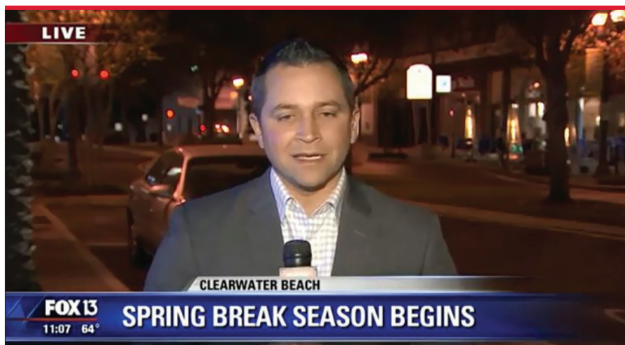
TPA is expecting record passenger numbers this spring break.