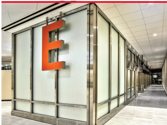
All of the concessions on Airside E, home of Air Canada, Delta and WestJet, are now complete.