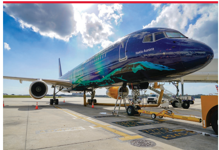
Icelandair will soon fly four times a week out of Tampa International Airport.

The announcement comes as TPA continues to hit record passenger numbers and focuses on increasing international air service. Last year alone, TPA saw a nearly 5 percent growth in international passengers, and it has seen more than 100 percent growth in international traffic since it began aggressively targeting key international markets seven years ago.