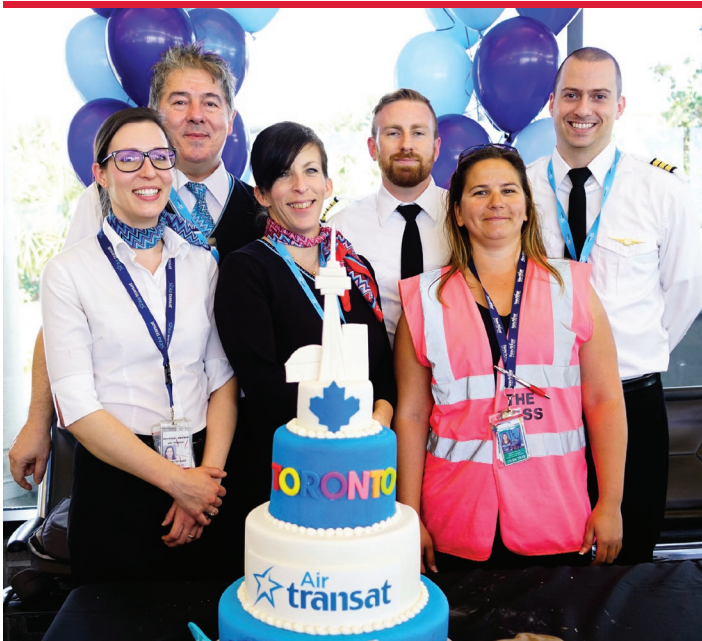
TPA celebrated the Air Transat’s two new routes with two awesome cakes.

The seasonal weekly flights depart on Sundays, and arrives at Airside F. To book your flight, visit AirTransat.com . ■