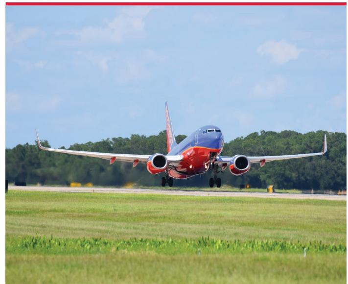
TPA’s seat capacity is growing rapidly thanks to new service announcements.

It’s been a busy 2018 in the air service world. In February, TPA launched new service to Columbus, Ohio aboard Spirit as well as new service (and a new airline) aboard Air Transat.