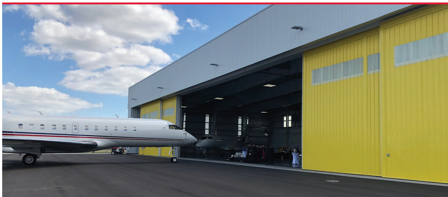
Sheltair purchased the former Tampa Jet Center in 2016 and was ranked the top fixed-base operator in the United States last year.

T ampa International Airport joined Sheltair Aviation Feb. 21 to celebrate the grand opening of its newest corporate hangar complex at TPA. The new addition gives Sheltair, one of the nation's leading fixed-base operators, the capacity to handle newer larger-cabin jets and the ability to meet the region's growing general aviation needs.