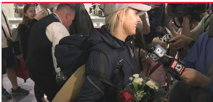
Members of the U.S. Women's National Hockey team arrived at TPA on Feb. 27.

Spring break season is officially here and Florida's tourism industry expects record crowds in the sunshine state. ... Tampa International Airport estimates 3.1 million passengers will travel through its terminals. ■