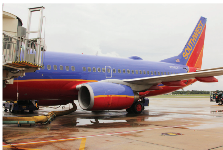
On Sunday, Southwest Airlines launched nonstop, twice-daily service to LaGuardia Airport in New York. The new service marks the first time Southwest has flown to LaGuardia from Tampa International Airport. It comes as Southwest continues to grow its network at TPA, strengthening existing service and adding new routes and destinations. TPA celebrated with a New York-themed cake, a Spider-Man, Statue of Liberty and a pirate for those flying into Tampa.