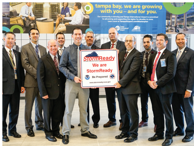
TPA's operations team was on hand June 1 to accept the National Weather Service "StormReady" designation.