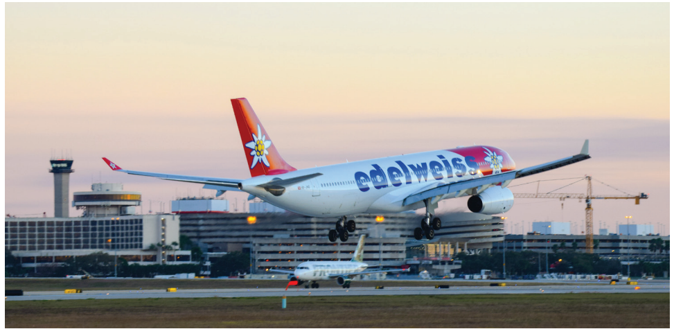
Following the success of Edelweiss, Tampa International Airport has added numerous new international flights.

On May 25, Edelweiss Air officially celebrated its fifth anniversary since beginning service between Tampa and Zurich, Switzerland. Since then, Edelweiss has served 107,263 passengers, contributing to an increase in international passengers since 2011. ■