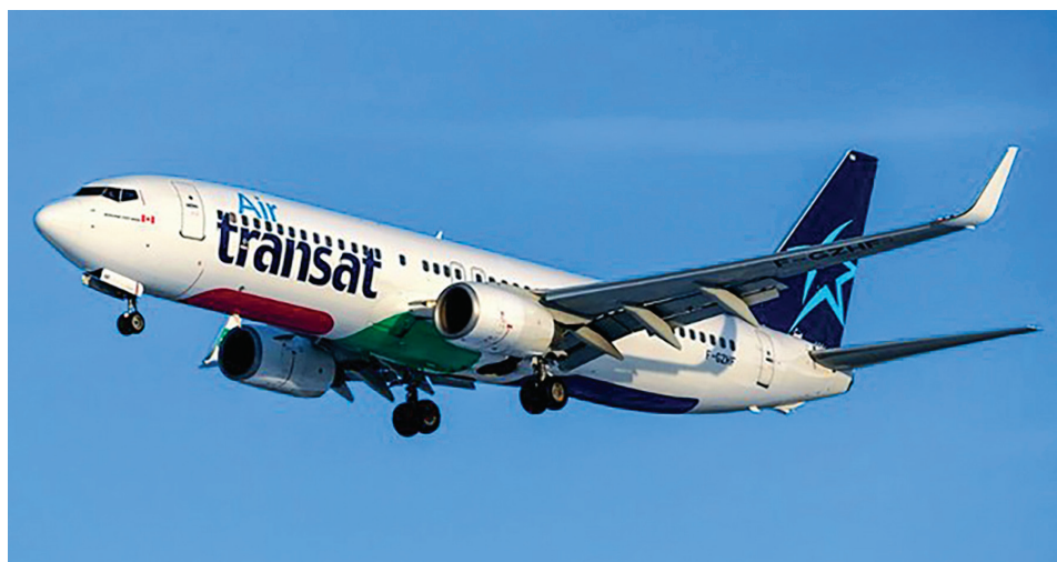
Air Transat begins offering nonstop seasonal service to Toronto and Montreal on Feb. 18. The weekly flights will operate on Sundays through April 18.

Tampa Bay is getting two new connections to Canada. On Thursday, Airport officials announced that Air Transat, a Canadian-based leisure airline based in Montreal, will begin nonstop flights to Toronto and Montreal on Feb. 18.