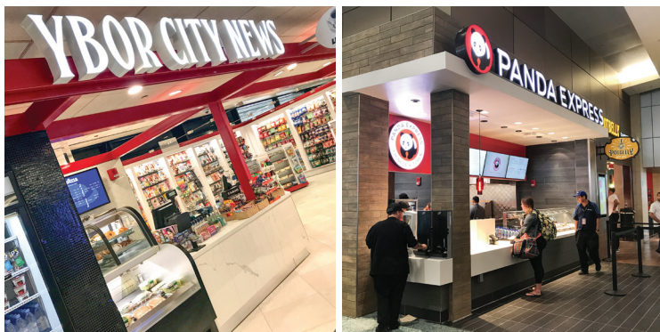
Thirty of the Airport's 69 new shops and restaurants are now open at Tampa International Airport.

A new Panda Express on Airside E and an Ybor City News on the blue side baggage claim are the two latest openings in Tampa International Airport's concessions redevelopment.