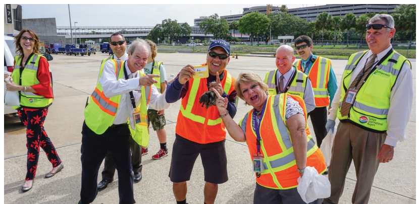
Airport employees and tenants work together to eliminate airfield FOD around Airside E, home of Delta Airlines.

Collecting FOD is important: Each year, the industry loses an estimated $4 billion to FOD-related damage. ■