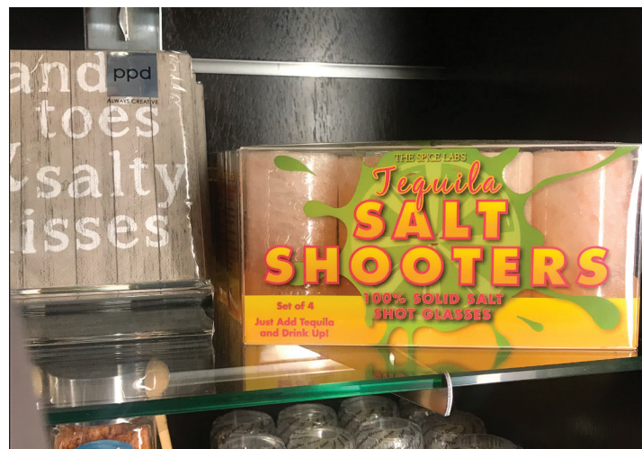
FORGET THE SHAKER: The perfect gift for the tequila aficionado in your life: Shot glasses made entirely out of salt. Locally produced by Spice Labs. Bottoms up! Newslink (MT)