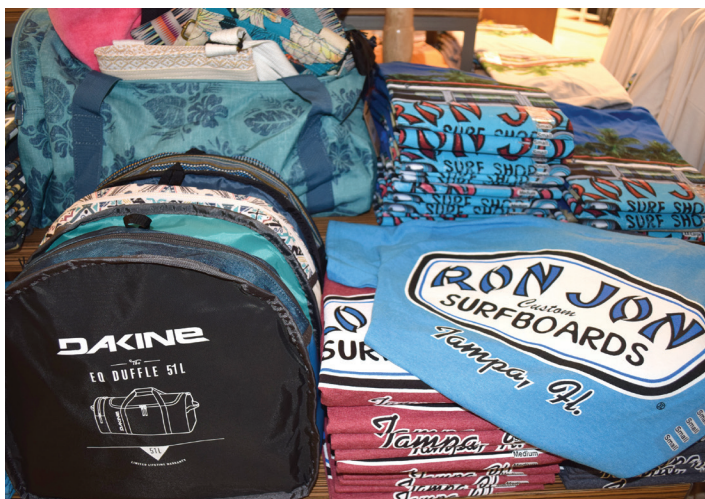
SURF'S UP: It doesn't have to be summertime to enjoy a taste of beach life. Grab shirts for everyone on your list with the Ron Jon Surf Shop, Tampa Bay edition. Ron Jon Surf Shop (A).