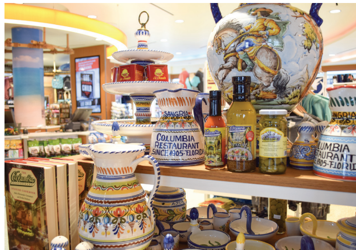
FOR THE ASPIRING CHEF: Give the aspiring chef the gift of culinary tradition, with sauces, spices and giftware from the Columbia Restaurant. Columbia Restaurant (E); Stellar Bay (A).