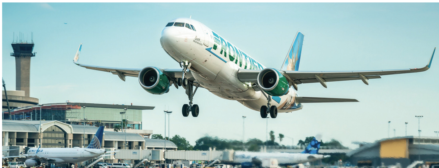
Frontier and Spirit have recently added or announced a multitude of new flights to destinations ranging from Las Vegas to New Orleans to Buffalo, NY.

It seems like every week Spirit or Frontier makes another air service announcement out of Tampa International Airport. Since early November, the two airlines have either announced or launched eight new routes. Here's how it breaks down: