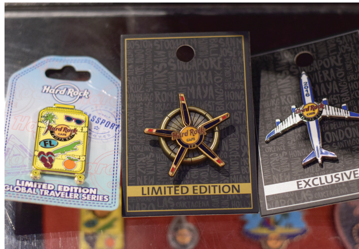
GIFTS THAT ROCK: Give that rocker or merchandise collector on your list, the Hard Rock gear that's only available at TPA, including pins, shirts and glassware. Hard Rock Cafe (MT).