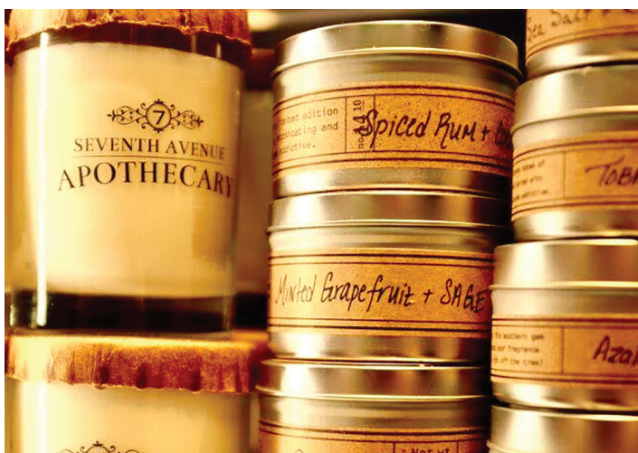
A SCENTS-IBLE GIFT: This local treat is a feast for your nose. Enjoy a selection of candles featuring unique scent combinations (minted grapefruit!) made locally by Seventh Avenue Apothecary. Newslink (MT/C); Air Essentials (E); Stellar Bay (A).