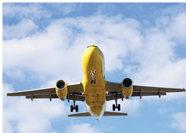
FLYING BANANA: An underbelly shot of Spirit's bright yellow livery!