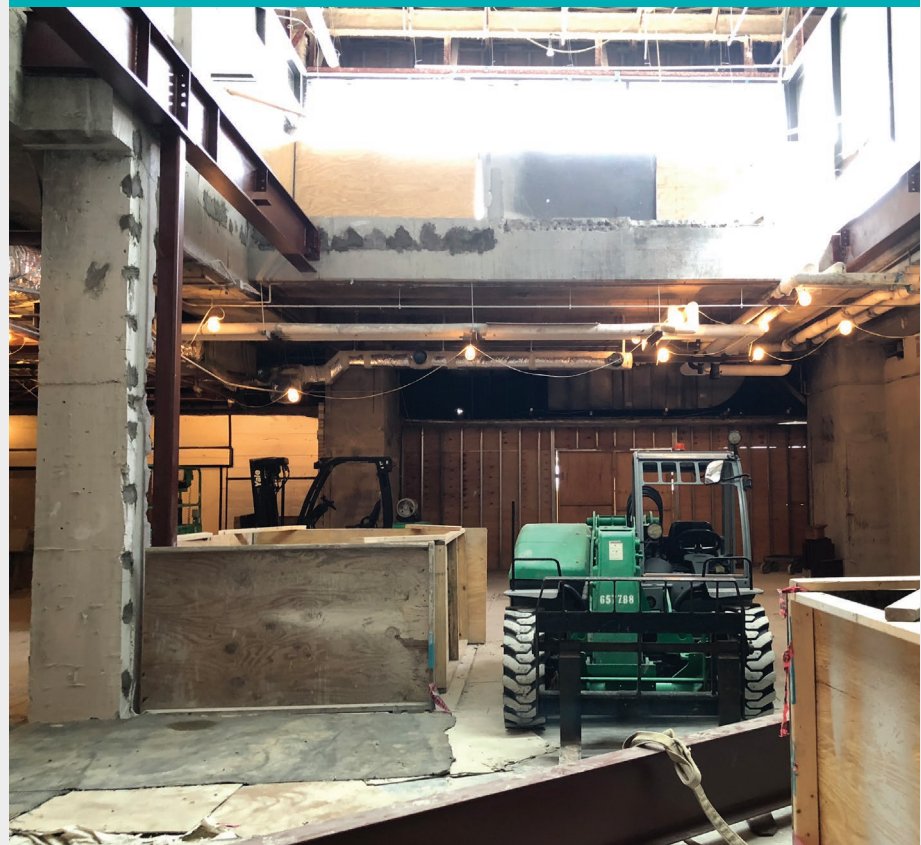
Crews are building out the west side transportation hold areas - expected to open next year.

Meanwhile, structural steel is being installed to enclose the old elevator and escalator access areas to the above quad decks. ■