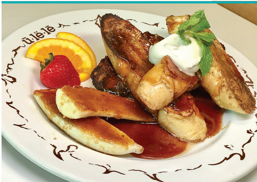
One of the most delicious items on the Ulele menu: The Tampa Banana French Toast, which features La Segunda Cuban Bread pan grilled to golden brown with bruléed bananas, brown-sugar rum sauce and Chantilly cream.

If you've visited Ulele on Tampa's Riverwalk, you've experienced its Native American inspired menu, open concept kitchen and, of course, unique food options. At the Airport, the restaurant parallels the atmosphere and has recently added a new concept that has early morning travelers thrilled to visit airside C – a breakfast menu.