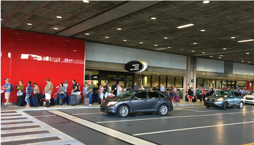
On Saturday, just hours before the last flight out, the line at the Southwest ticket counter snaked out to the curbside. Factoring in commercial and general aviation operations, the Airport saw 672 departures and landings on the Friday before the storm hit - well above the usual average.