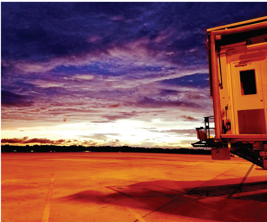
Tampa International Airport closed for operations at 8 p.m. on Saturday. No aircraft - commercial or general aviation - were on the airfield. All of the gates were pulled towards the Airsides and strapped down for safety. The beautiful sunset belied what was in store for Tampa Bay. TPA experienced sustained winds of 52 miles per hour with a peak gust of 66 mph.