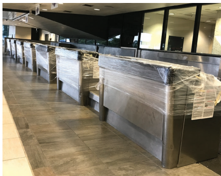
Plastic protected the curbside check-in stations from Hurricane Irma - one of many measures taken to limit storm damage. Airline employees also covered ticket counters and TSA workers covered the security checkpoint areas with blue tarp. The Airport experienced minimal damage inside the terminal and airside.