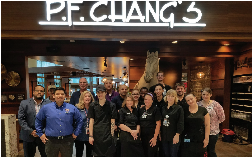
Host employees, pictured here in front of P.F. Chang's, were among numerous concessions workers who remained at TPA during the storm. Employees from Newslink, SSP, Bradford, HBF, Hudson/WDFG and the Marriott Hotel also remained at the Airport during the storm.