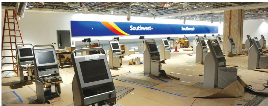
HCAA maintained its strong bond ratings even with large capital projects.