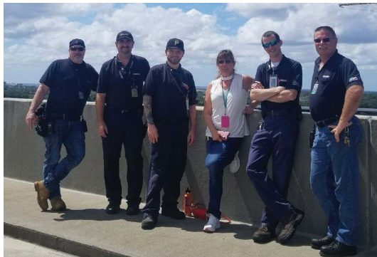
The Bombardier team remained on site to ensure that the Airside shuttles were promptly inspected and reopened.