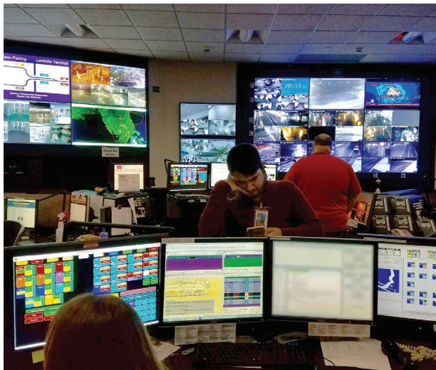
The AOC, pictured here, was a flurry of activity as tropical storm-force winds pummeled TPA.