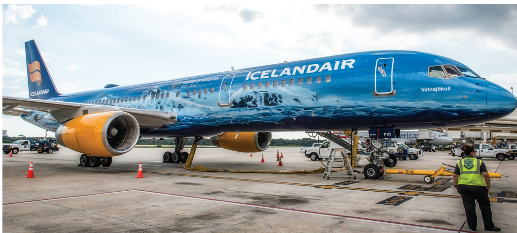
Icelandair celebrated its inaugural departure from TPA on Sept. 7, launching twice-weekly nonstop service to Reykjavik. Icelandair is the third new European flight since 2011 at Tampa International Airport.