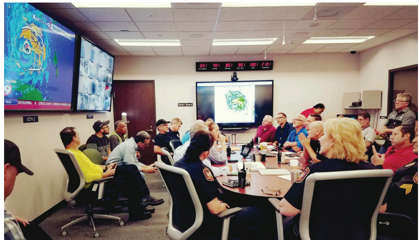
Stormriders gathered Sunday morning to discuss hurricane preparations in the Incident Command Center. Airport operations partially activated the ICC at 8 a.m. on Thursday Sept. 7, launched full activation on Saturday morning and deactivated at 6 pm. Tuesday, Sept. 12 The Aviation Authority team and partners met 10 times in the ICC.