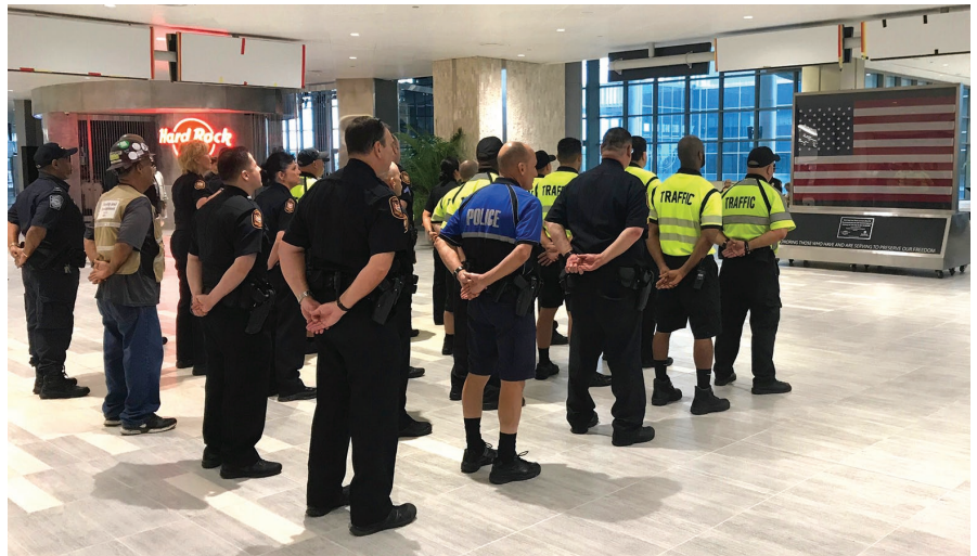
With clean-up from Hurricane Irma underway on Sept. 11, members of the Tampa International Airport Police department paused to remember those who lost their lives in the 9/11 attacks.