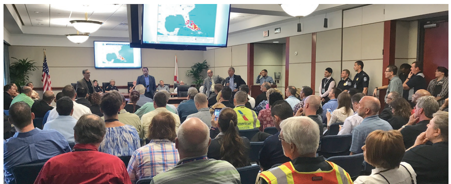
The Aviation Authority and partners, including airlines, concessionaires and Master Plan contractors, met at least once a day to coordinate hurricane plans.