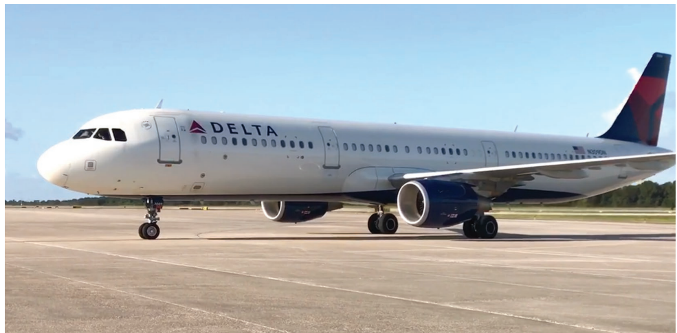
A Delta Air Lines flight from Atlanta at 8:55 a.m. on Sept. 12 marked the restart of commercial operations post Hurricane Irma. Commercial operations returned to 100 percent less than a week after the storm.