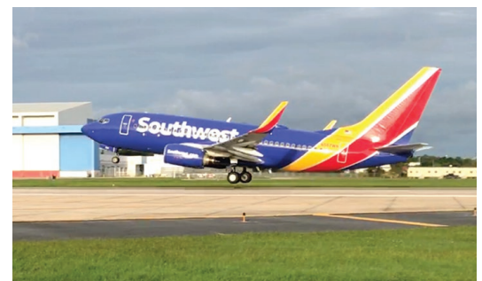
Southwest Airlines flew the final two flights out of TPA on Saturday shortly before 8 p.m. Southwest's last flight ferried staff and crew members to Dallas.