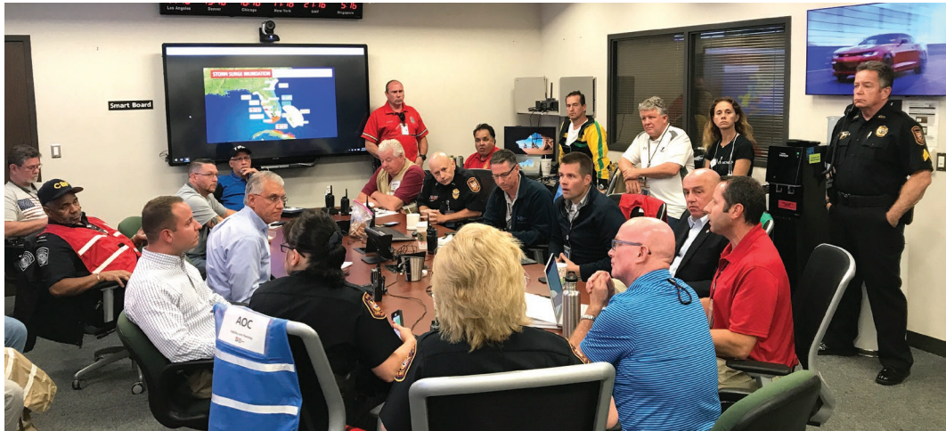
Dozens of Aviation Authority employees, including staff from Operations, Guest Services, Maintenance, Planning & Development, Police, ARFF and others remained at TPA through the duration of Hurricane Irma.

T ampa International Airport spent days preparing for all that Hurricane Irma might bring to the Tampa Bay region.