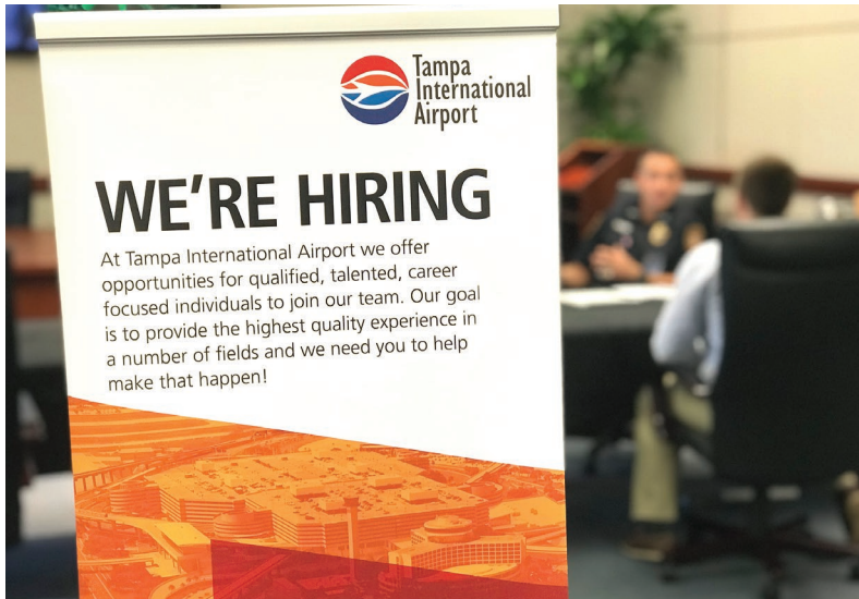
Dozens of applicants attended the Authority's job fair, which was designed to streamline the hiring process for qualifying candidates.

Tampa International Airport held a successful job fair on Friday, Oct. 6, bringing in dozens of applicants for a wide range of positions with the Hillsborough County Aviation Authority.