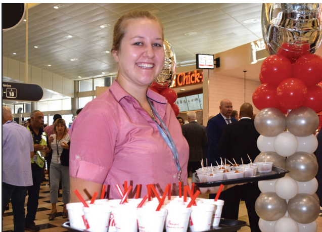
Guests celebrated the opening of Chick-fil-A with shakes and snacks.