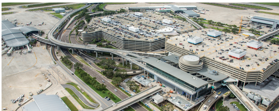
Tampa International Airport viewed from the sky earlier this month.