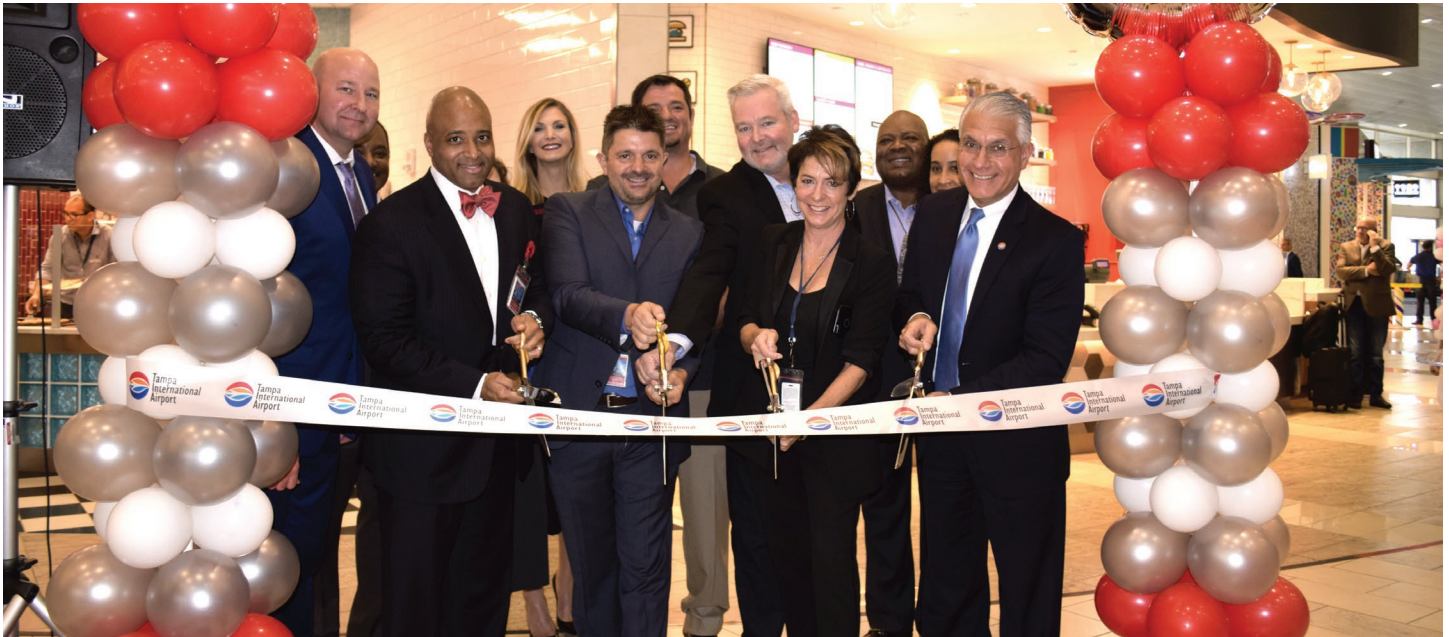
Executive Vice President of Operations and Customer Service cuts the ribbon on five new shops on Airside A.