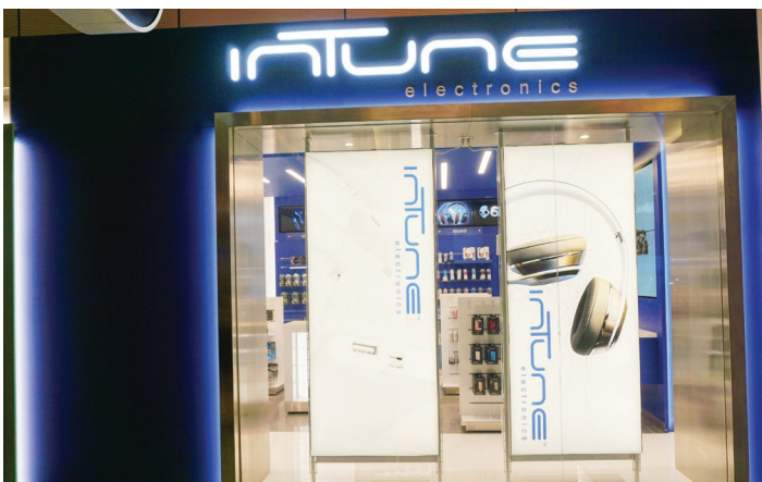
InTune Electronics is officially open on Airside E. The electronics shop features a wide range of electronic goods for today's travelers.