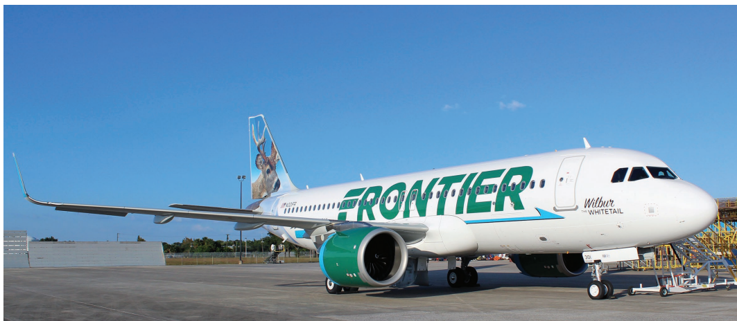
With the addition of 12 new routes, Frontier now serves 18 destinations from Tampa International Airport.

F rontier Airlines on Oct. 5 launched the first of 12 nonstop destinations coming this fall to Tampa International Airport, including nonstop service to Colorado Springs - a new destination for TPA.