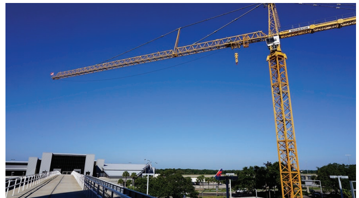
The final tower crane.

HART now offers three routes to Tampa International Airport. The buses will stop at the Rental Car Center's commercial curb.