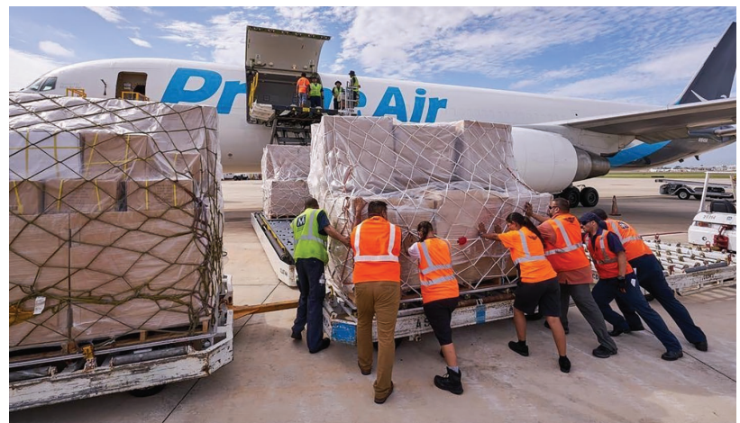
The Amazon team pushes boxes of relief supplies destined for Puerto Rico. The team donated tents, tarps, baby formula and more to the island.

Amazon CEO Jeff Bezos tweeted this photo of the plane being loaded at TPA and said, "Amazon plane packed with donation of critical supplies landed earlier today in San Juan. Thank you to all the Amazonians who made it happen." ■