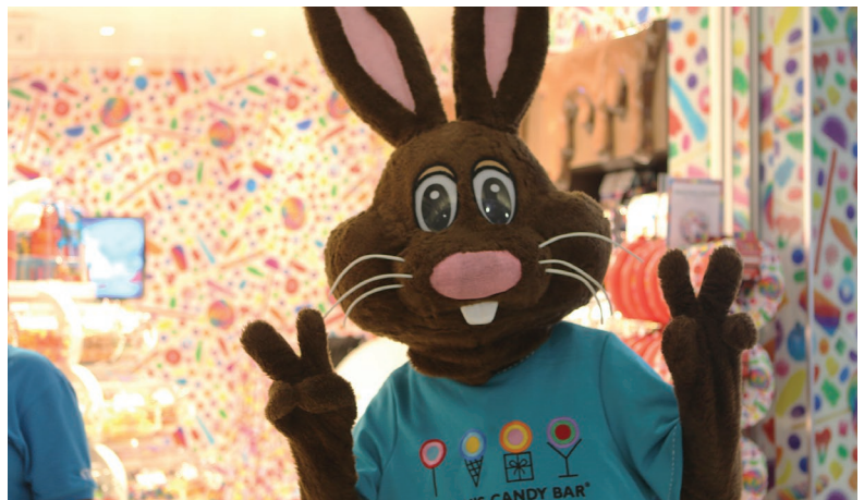
Dylan's Candy Bar marked its grand opening with a giant chocolate bunny.