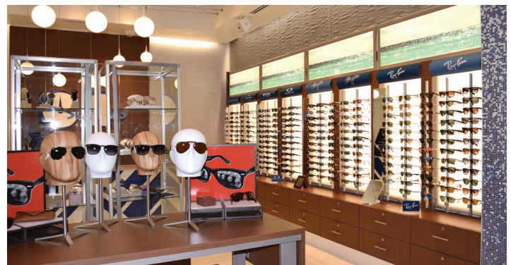
Shades of Time on Airside A features high end sunglasses and watches.