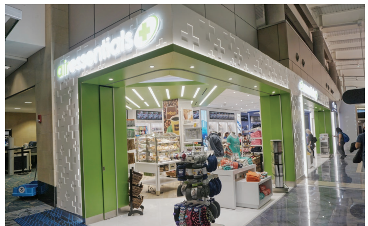
Air Essentials offers Kahwa coffee, fresh pastries and a wide range of goods designed to improve passengers' travel experience.