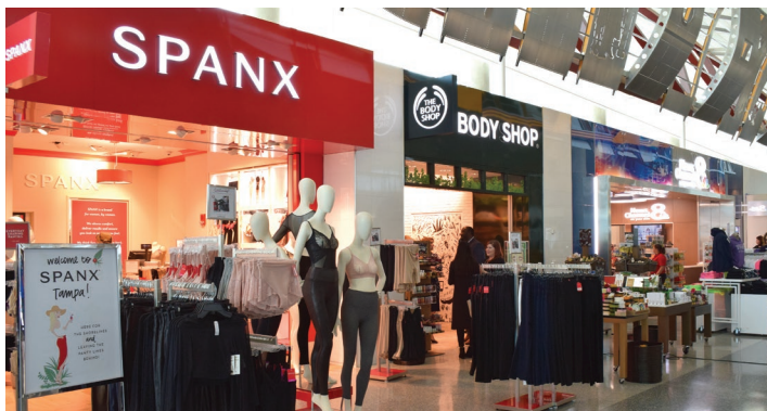
SPANX, shown here, has reported strong sales in its first few months.