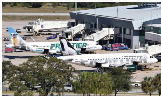
Frontier Airlines operates out of Airside C along with Southwest Airlines.