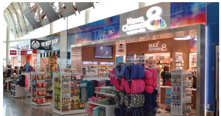
News Channel 8 brings a local flair to the news convenience business.