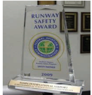
TPA receives the 2009 Runway Safety Partnership Award